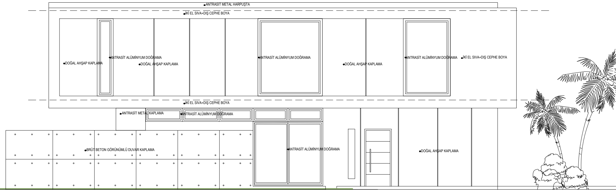
FRONT ELEVATION TYPE L1-L2